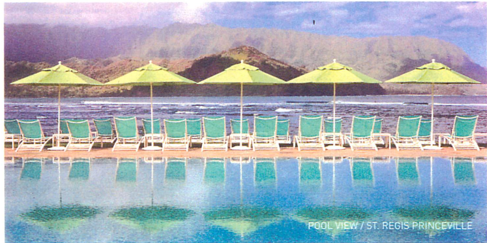
POOL VIEW / ST. REGIS PRINCEVILLE