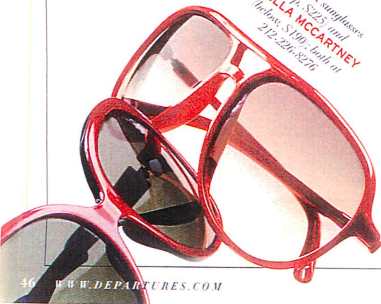
PRADA sunglasses top, $225 and STELLA MCCARTNEY below, $190; both at 212-229-8276