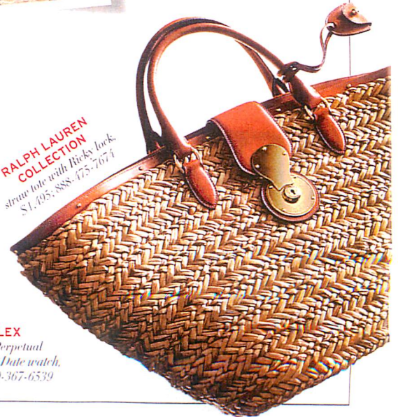
RALPH LAUREN COLLECTION straw tote with Ricky lock, $1,495; 888-475-7674