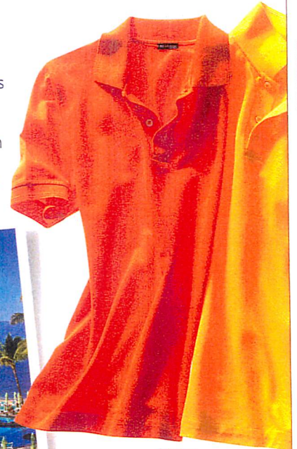
KITON shirts, $395 each; 212-813-0272