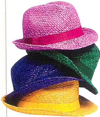
ETRO straw hats, $155 each; 212-317-9096