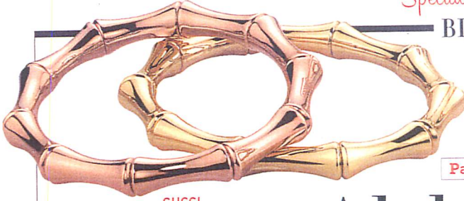
GUCCI 18-karat pink- and yellow-gold Bamboo bracelets. $2,495 each; 800-456-7663