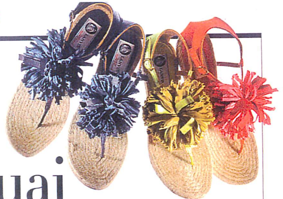
LANVIN woven raffia sandals. $585 per pair; 305-864-4254