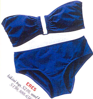
ERES bikini top, $210, and bottom, $130; 888-656-3337

Regis took over the old Princeville Resort and reopened it last October with 252 revamped rooms, an infinity pool, a 10,000-square-foot spa, and a Jean-Georges Vongerichten restaurant. Rooms, from $850; 808-826-9644; stregisprinceville.com .